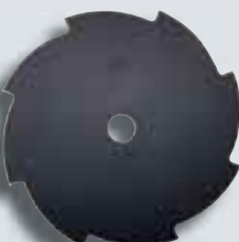
Grass blade 8 teeth