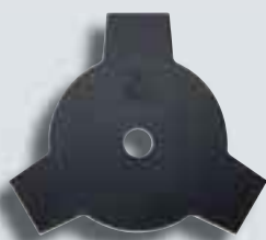
Grass blade 3 teeth