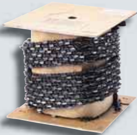
Chain reel gauge 0.58/1,5