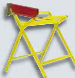
Wood rack with chainsaw support