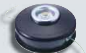
Trimmer head "Twist and Go"