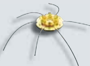
Head n. 6 nylon lines