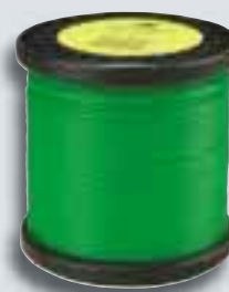
Nylon line reel