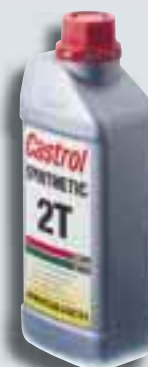
2 stroke oil 1 l