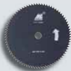
Grass blade 80 teeth