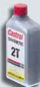
Two stroke oil 125 ml