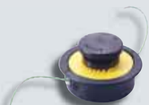
Trimmer head "Tap and Go"