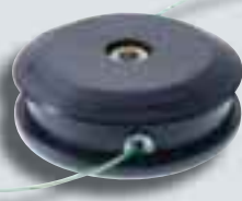
Automatic trimmer head