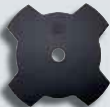
Grass blade 4 teeth